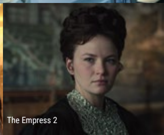
The Empress 2