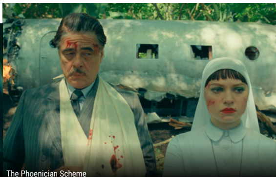
The Phoenician Scheme