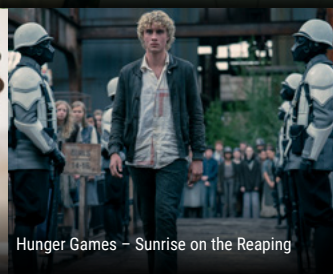
Hunger Games – Sunrise on the Reaping