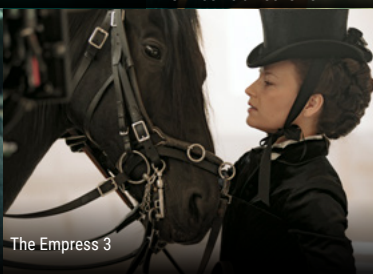
The Empress 3